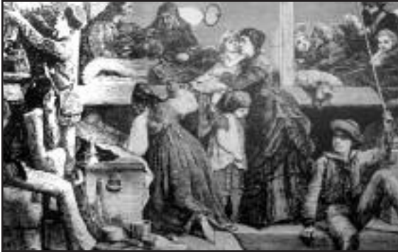
Aboard Emigrant Ship