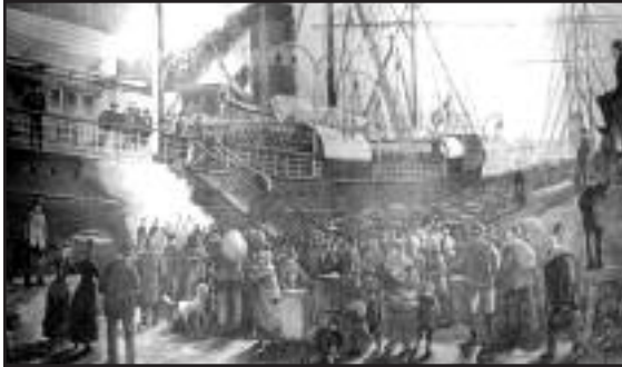
Emigrant Ship leaving Denmark