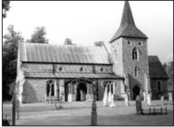
Stisted Parish Church, Stisted, Essex, England